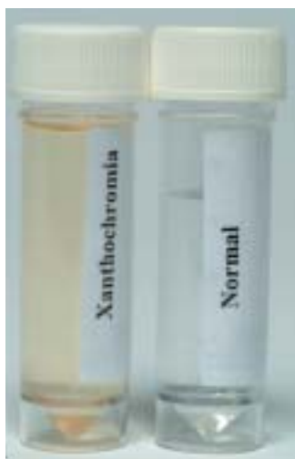
Figure 1 Visual examination of CSF showing xanthochromia in one bottle.

When red blood cells in the CSF haemolyse, they release oxyhaemoglobin, which can be detected within 4–10 h of a bleed, at a wavelength of 415 nm (Barrows et al. 1955). The enzyme haem oxidase, which is found in macrophages, the arachnoid membrane and the choroid plexus, then converts oxyhaemoglobin into bilirubin, detected at 450–460 nm. The time course for this conversion is uncertain. It has been reported to be 9–10 h (Fishman 1980), after 24 h (Wahlgren & Lindquist 1987) or at 3–4 days (Barrows et al. 1955). In practice, doctors generally delay CSF examination in CT-negative patients with sudden headache by 12 h from the onset to 'allow' the yellow colour to develop. This is because in one study of 111 patients with CT-positive SAH, they all had 'xanthochromia' on spectrophotometry at 12 h until 7 days after the onset (Vermeulen et al. 1989). However, this is clearly a different group from CT-negative patients, either because so little blood has been